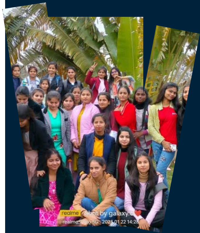
recimedial by galaxy. realmedial 5G 2023-01-22 14:28